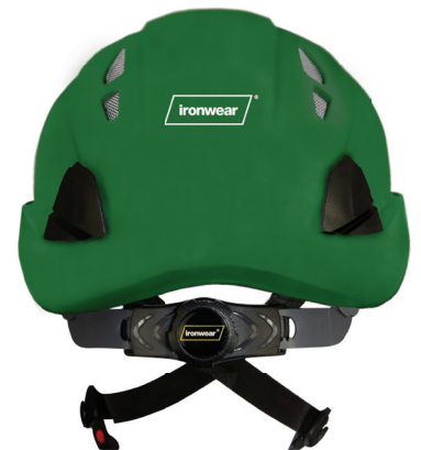
(Back with Ratchet)