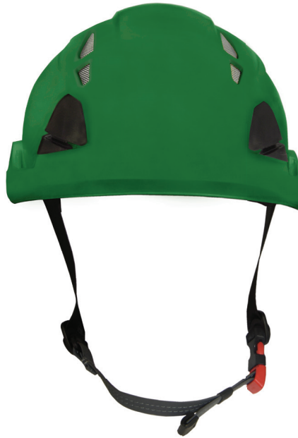
(Front with Chin Strap)